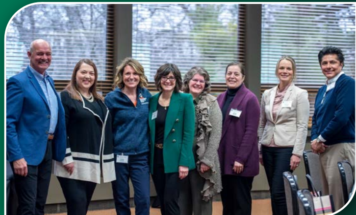
Leaders from Capital-area workforce and education organizations gather to share their expertise