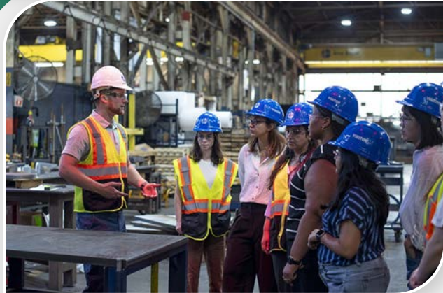
Students visited Alro Steel to learn about how Alro has adapted to changing environments